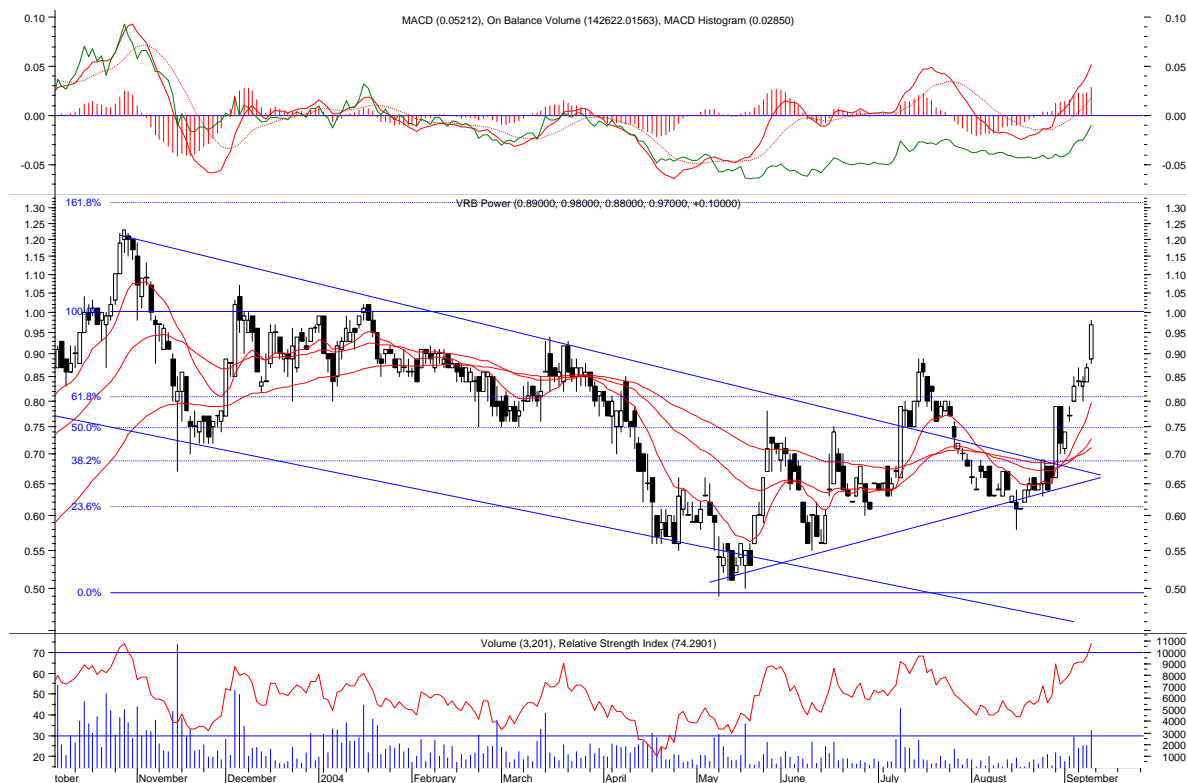
Daily chart, Semi-log scale